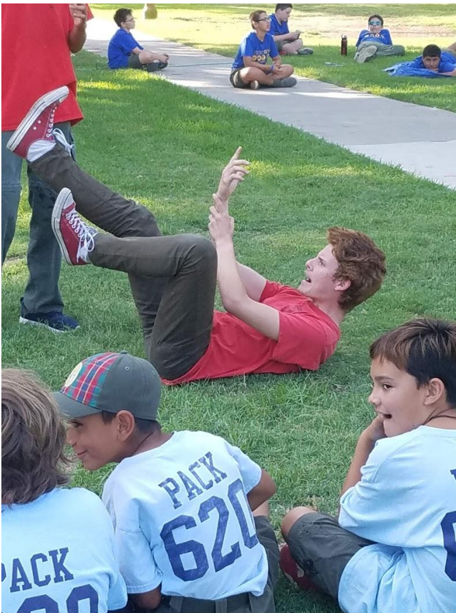
Hamming it up, training Webelos

5 th , 6 th and 7 th ORANGE FRONTIER DISTRICT 2018 CamporAll at El Dorado Park in Long Beach