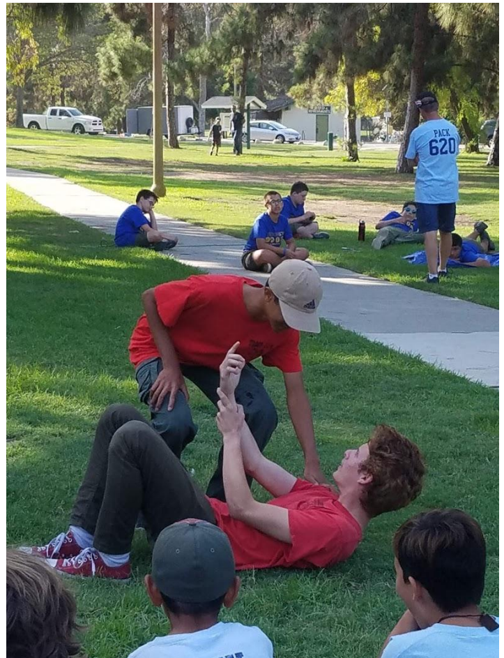
In the fine art of Scouting.