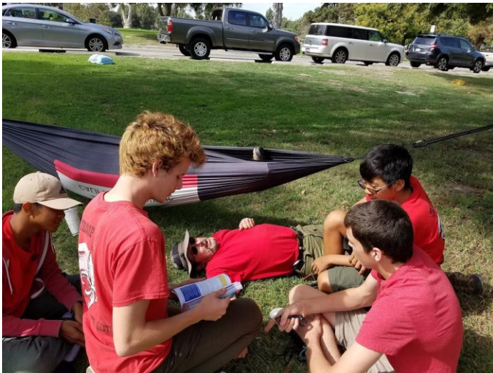
Camp at El Dorado